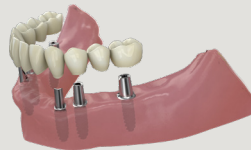
Cement-retained or trans-screwed bridge on implants