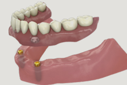
Removable prosthesis stabilized with implants